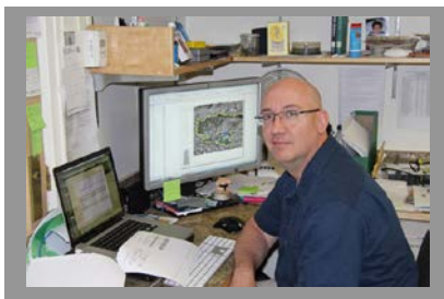
Workstation in Kirk Hall

Our PhD program supports training in physical and human geography, as well as geographical tools and techniques . The range of themes explored by our faculty is wide, however among our strengths are hydrology, urban planning, remote sensing, and natural resource management. Opportunities for conducting research are found across the globe, from Canada and the Czech Republic, to China and New Zealand. More information can be found at our website artsandscience.usask.ca/geography/ .